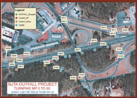
GIS Mapping & Inspection of over 5000 Drainage Outfalls on the Garden State Parkway & New Jersey Tumpike