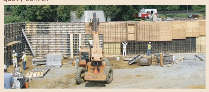
Construction Supervision for Homdel State Police Facilities, Holmdel NJ - NJTA

For commercial, residential, educational and transportation facilities and buildings, KSE provides all pre-construction services, as well as on-site resident engineering, management and inspection services for contractor conformance to project requirements and compliance to design intent, safety and auality control.