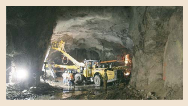
Construction Management for No. 7 Subway Line Extension Project – MTA Capital Construction NYC Transit