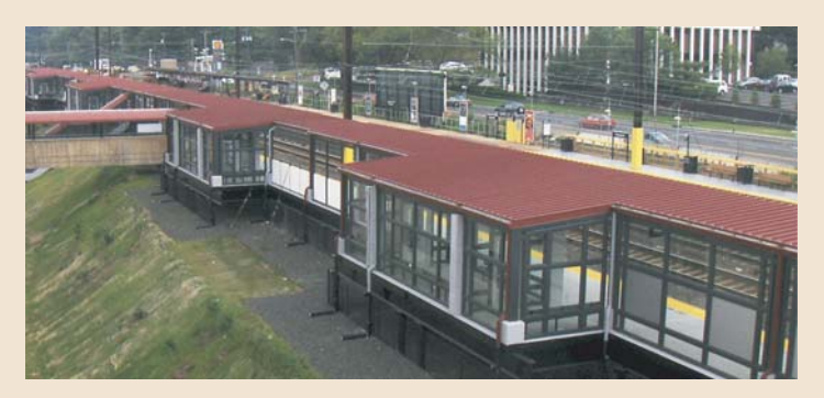
Construction Management Services for Metropark Station Platform Reconstruction-NJ Transit

We provide comprehensive construction inspection assistance and management for light and heavy rail, subways, commuter rail, freight rail and high-speed rail, including yards, shops, terminals, stations, bridges and tunnels. KSE consistently meets client expectations and project objectives in a professional and cost effective manner.