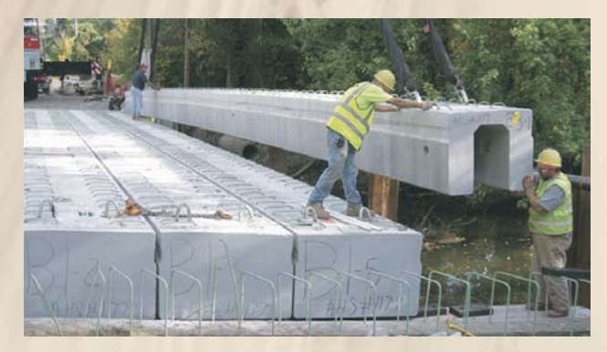
Replacement of Troy Road Bridge over Whippany River, Construction Inspection East Hanover Morris County, NJ

KS Engineers, P.C. (KSE) provides comprehensive construction inspection and management services on projects key to the region's transportation infrastructure, the educational community and for both public and private facilities and buildings. Nearly half of our professionals are supporting clients on construction engineering, inspection and management assignments throughout the region. Whether project needs call for a professional CM to augment the owners staff with pre-planning, design, construction, engineering and management expertise or on-site construction teams consisting of resident engineers and inspectors for reviewing work in-progress for contractor conformance to the specifications, design intent and safety programs, KSE has the expertise in carrying out successful field programs. We are a full-service, award winning, state certified engineering, survey and construction management MBE/SBE/DBE.