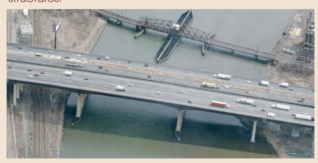
Construction Inspection Services for Bridge Deck Reconstruction and Miscellaneous Structural and Roadway Improvements, over Passaic River - NJTA

From simple to complex bridge projects, involving rehabilitation, replacement, painting, demolition or new facilities KSE is a leader in providing full service construction inspection and management for vehicular, rail, pedestrian, movable, trestle, viaduct and culvert structures.