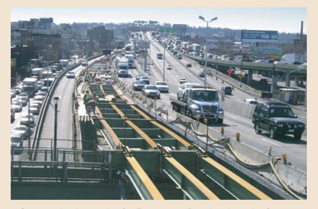
Construction Inspection for Emergency Repairs along the Gowanus Expressway Viaduct (I-287), Kings County, NY - NYSDOT