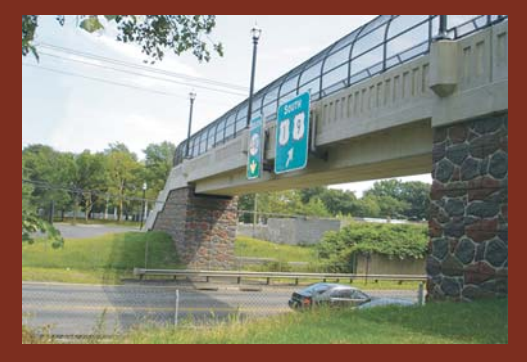
Design & Construction Inspection for Three Lincoln Park Bridges in Jersey City, Hudson County – NJ